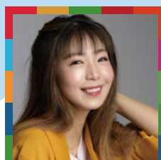
Chigusa Radio · Personality